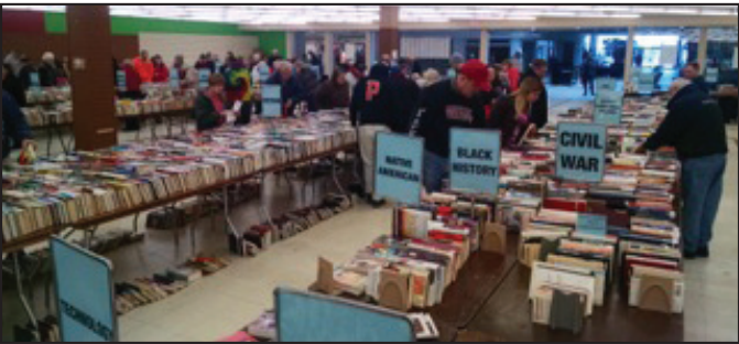
Book lovers discover literary treasures at Friends of CCLD Annual Book Sale (February 2015).