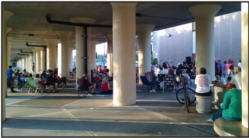
Friends Summer Concert Series, Steele Memorial Library by The Elmira Promenade, July 2015.

I have always imagined that Paradise will be a kind of library. ~ Jorge Luis Borges