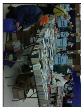
Friends of CCLD Annual Book Sale (Coming February 2015)

Become a Friend of the Chemung County Library District